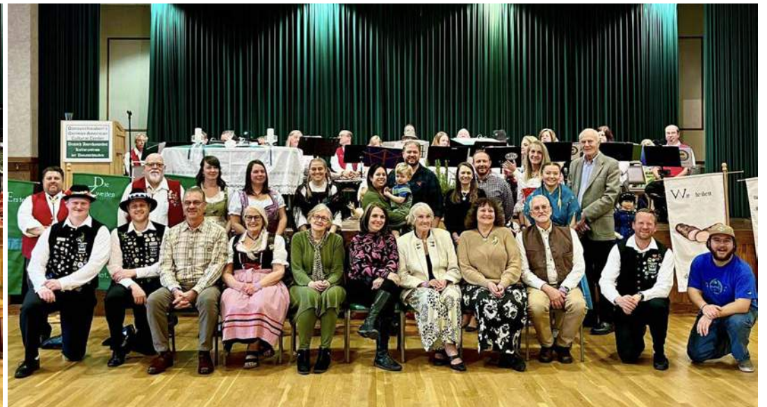
Gold Pin Award Recipients