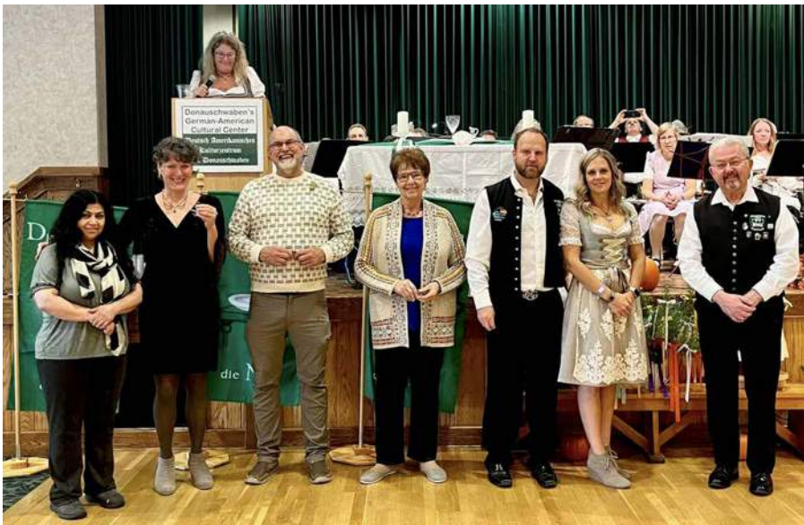
Silver Pin Award Recipients