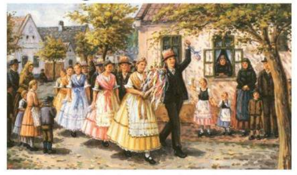
This traditional Donauschwaben festival was celebrated annually in the villages as a family affair to commemorate the church dedication anniversary.

Bring your family and friends for a fun afternoon of Tradition, Entertainment, Music, Dancing, Great Food and German Beer!