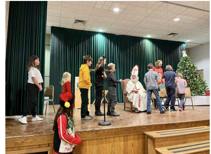
St. Nikolaus closes out the afternoon festivities with goodies for all the good boys and girls!