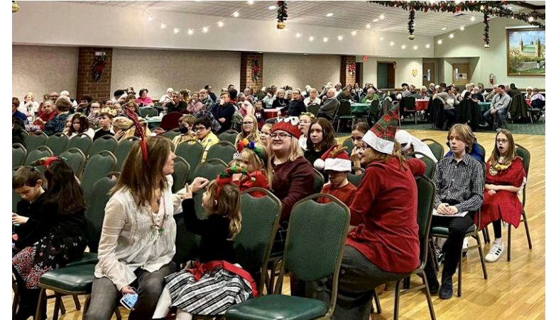
Above: Students wait for their turn on the stage.