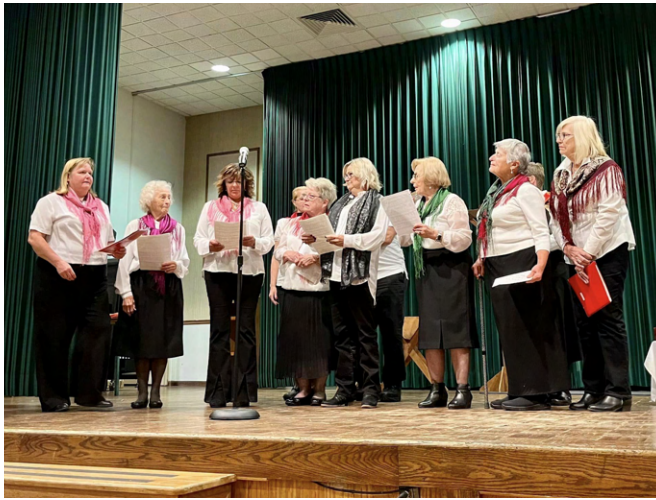
The Banater Chor performs some Weihnachtsfeier favorites!