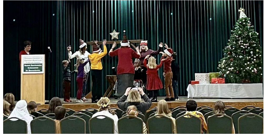
Deutsche Sprachschule students present their program!