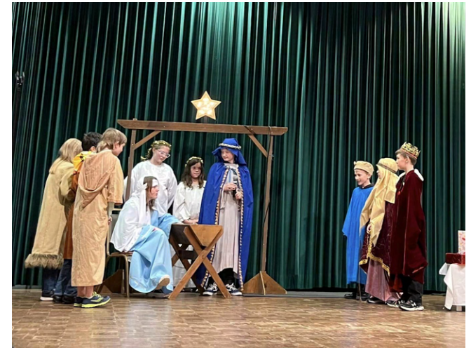
Deutsche Sprachschule students present the annual Krippenspiel!