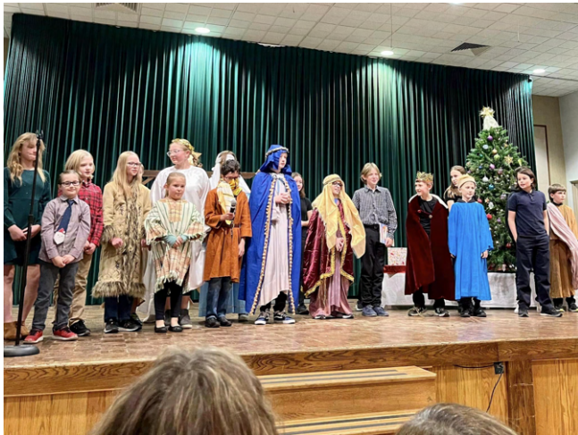
Deutsche Sprachschule students present the annual Krippenspiel!