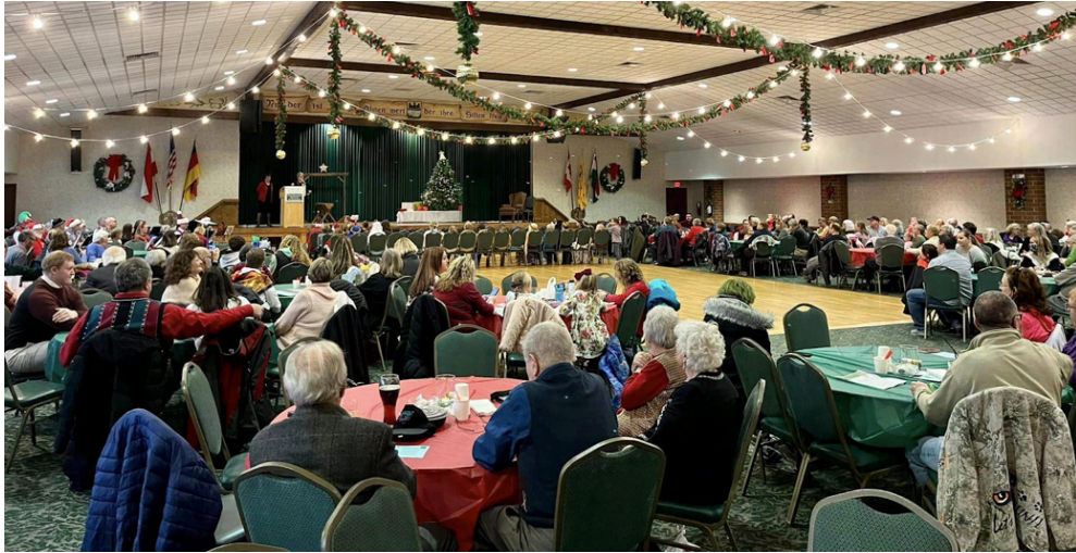
Members gather to enjoy the afternoon!