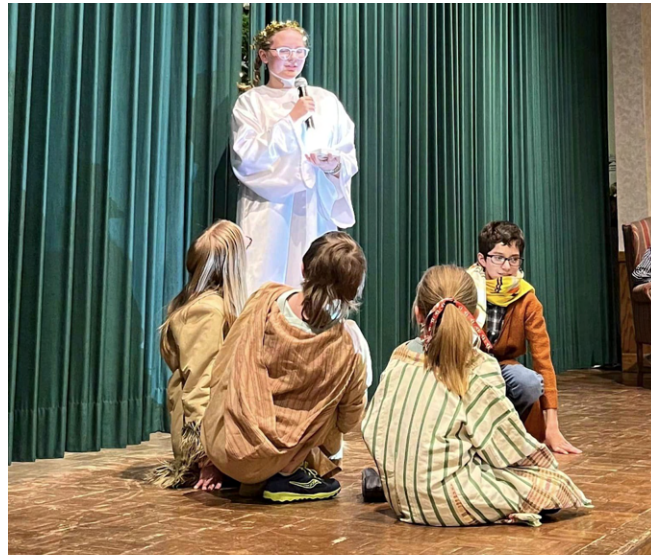
Deutsche Sprachschule students present the annual Krippenspiel!