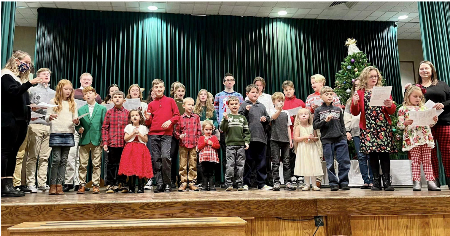
The Jugendgruppe and Kindergruppe team up to sing annual favorites!